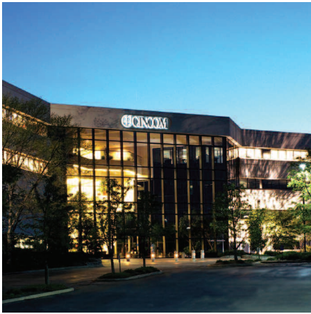
Cincom World Headquarters, Cincinnati, OH, USA