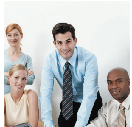
Simplify your data center operations through Cincom Hosting Services.

And at the same time, we can help reduce your costs, and manage your risk – all by taking your data center hassles off your hands and letting you get back to your business.